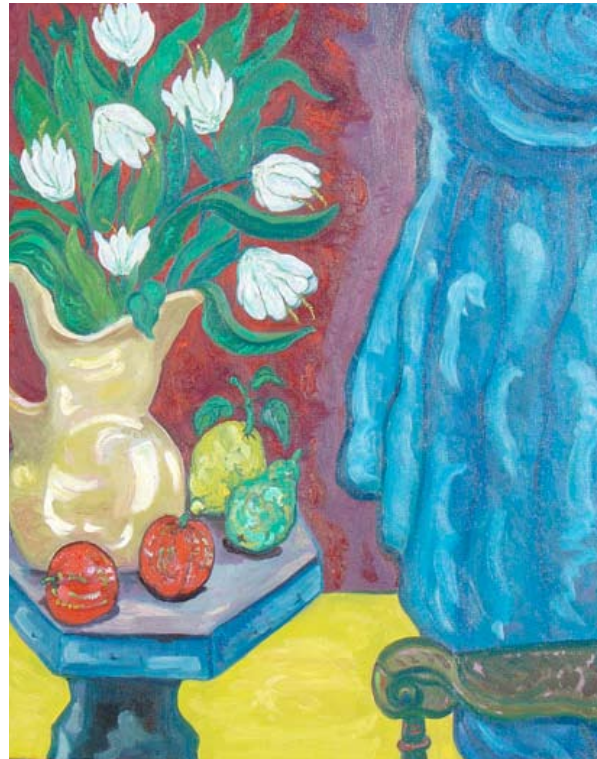
Still life with fruits & flowers

Please look and find more informations in the artist internet pages www.delgadoatelier.com under "San Gimignano paintings".