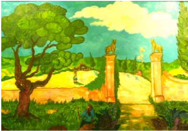
Landscape from Tuscany