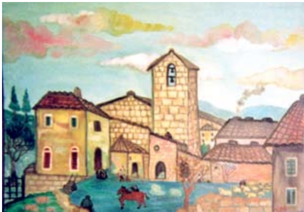
Paesage from Sutri

You can send a photo of your choice taking in San Gimignano or the surroundings landscape by e-mail: contact@delgadoatelier.com or you can send your photo by mail.