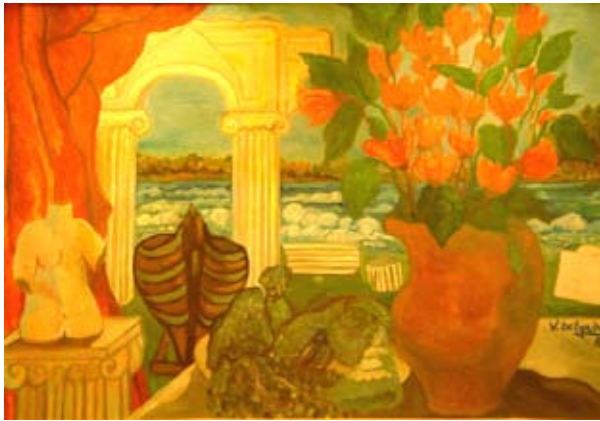
Seascape with flowers