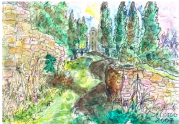
Drawing & watercolours